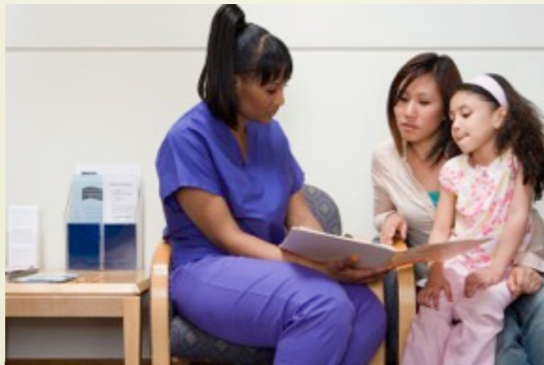
Patients and Patient Advocates